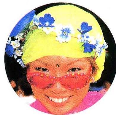
• (Above) Photos from Merry ★